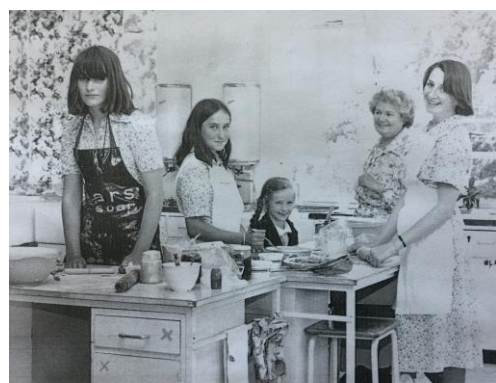
Cookery Class 1960