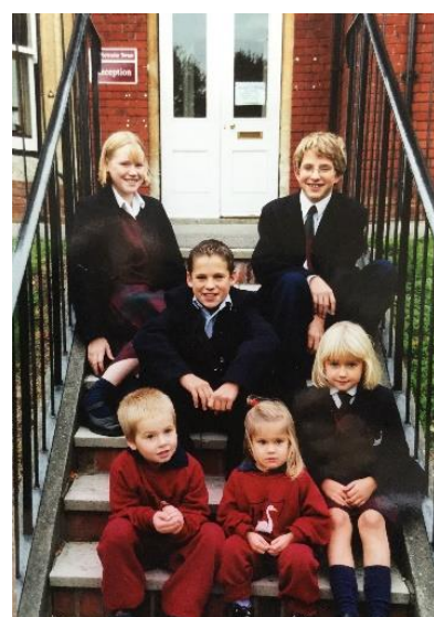
School Grounds 2000