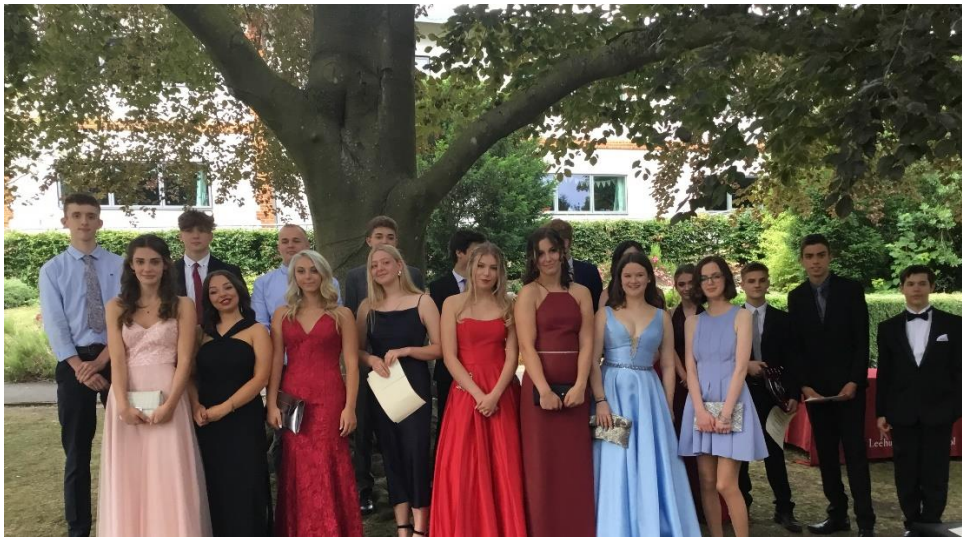
Class of 2018/19