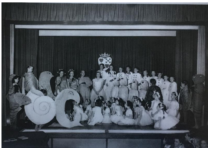
Alice Through the Looking Glass Oct 1949