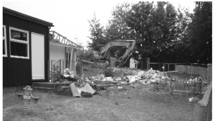
(above) demolition July 2013