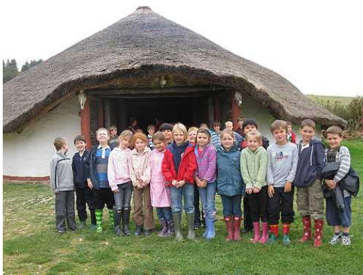
Senior School Prizegiving

and found conditions in the past to be more primitive than they enjoy now.